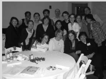
Lecture Attendees. How many people do you know? Next time, your picture should be here.