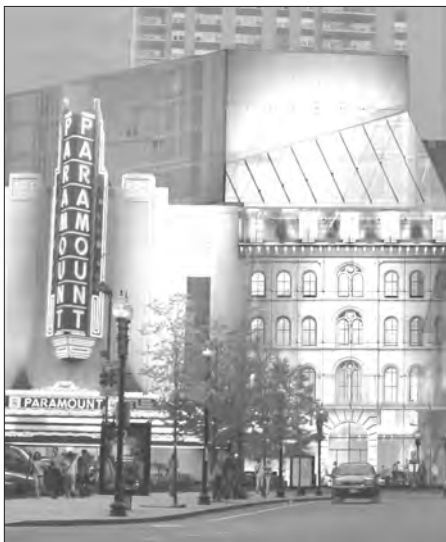
Artist rendering of the Paramount Center and Residence Hall

In Boston, renovations are nearing completion on student residences in the historic Colonial Building. Construction is also continuing at the Paramount Center complex, which will house production and rehearsal space, a film screening room, sound stage, scene shop, classrooms, and a residence hall (anticipated 2009-2010).